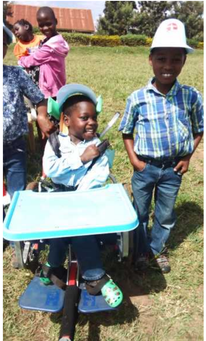
Children with Cerebral palsy having fun on the CP day celebration in a Picture at Bukerere playground 2019